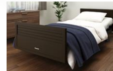
Long-Term Care Bed