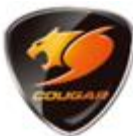
Gaming Own Brand